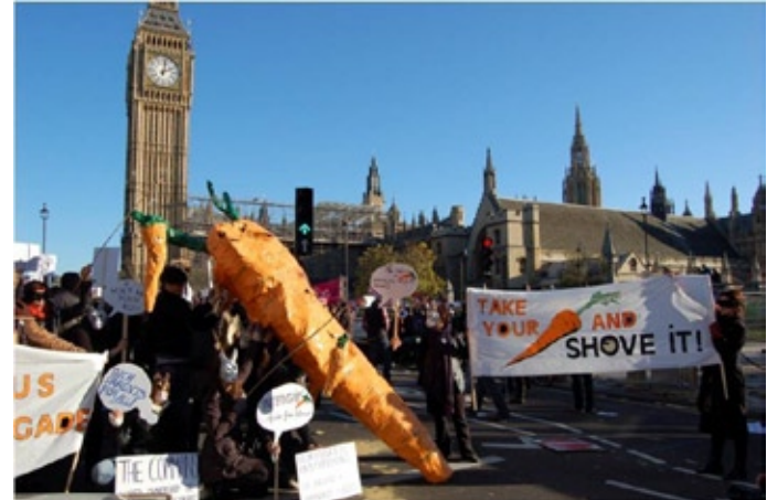
On 10th November, a 12-foot carrot was returned to parliament as a symbol of our refusal to accept the false promises made by the government

While this ‘credit crisis’ has exposed the bankruptcy of the system that produced such huge inequalities in gender, class division and social mobility over the last 30 years, the solution proposed is of course, more of the same, and worse. In the UK context where we are based, this ‘solution’ has been called the ‘Big Society’, an expression that was used as the flagship policy idea of the 2010 Conservative Party general election manifesto. The ‘Big Society’ places a strong emphasis upon personal responsibility and initiative, the rhetoric it mobilises is the one against the ‘culture of entitlement’ in which citizens of the welfare state supposedly indulge. It is a (mis)appropriation of notions such as self-