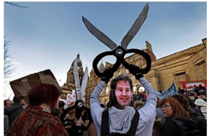
Jedną z wielu twórczych odpowiedzi na cięcia na niedawnym marszu przeciwko proponowanemu podwyżkom czesnego w Wielkiej Brytanii